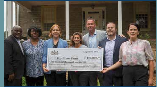
At Fox Chase Farm with my colleagues presenting a $100,000 preservation grant for its historic Manor House.